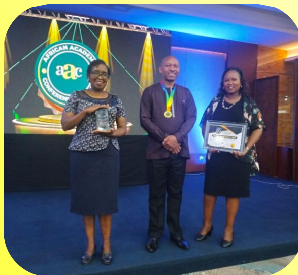
Figure 1 The Nyeri National Polytechnic emerges the winner of the African Academia Conference & Awards (Third Edition, 2025) in the Best Holistic Institutional Excellence and Community-Integrated Technical Training category in Kigali, Rwanda.